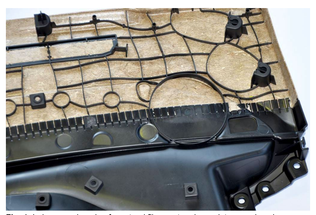
Fig. 4: Indoor panel made of a natural fiber mat and recyclates, produced on a MacroPower 1100 with a mold supplied by FRIMO