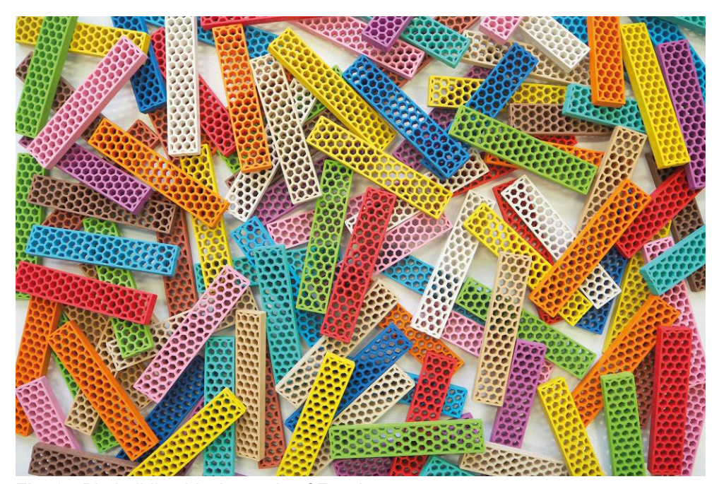
Fig. 3: Bio building blocks made of Fasal