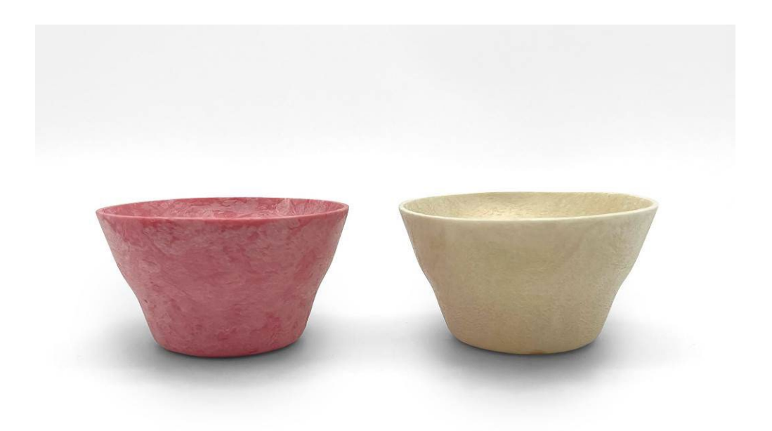
Fig. 2: Biodegradable ice-cream cup made of BAOPAP