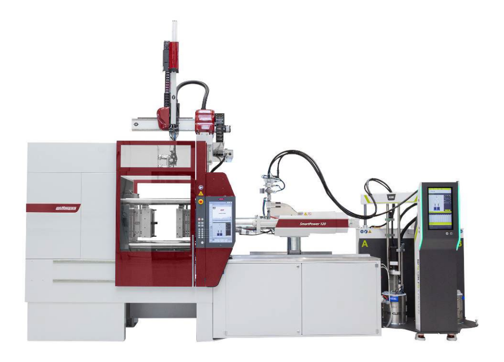
Fig. 6: SmartPower 120/350 LIM with Nexus X200 metering unit