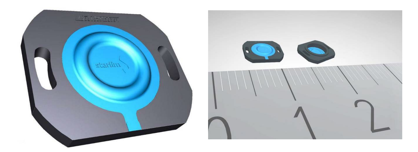
Figs. 7a+b: Membrane made of thermoplastic and liquid silicone for a high-quality micro loudspeaker, manufactured on a MicroPower 15/10H/10H Combimould