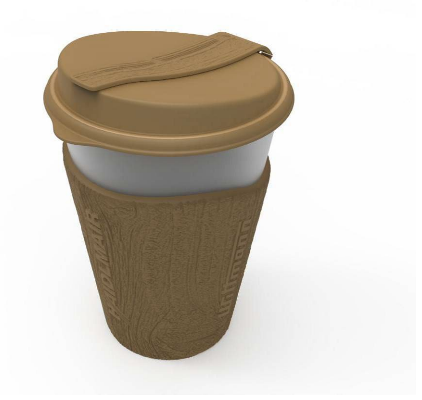
Fig. 1: Re-usable coffee-to-go cups in 3-component technology