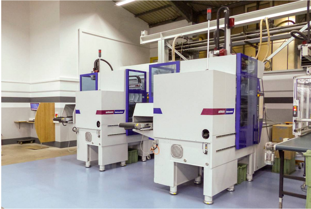
Fig. 1: SmartPower 60 and SmartPower 90 , equipped as Insider cells.