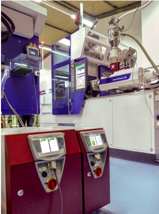
Fig. 3: WITMANN TEMPRO plus D temperature controllers integrated in Insider cells