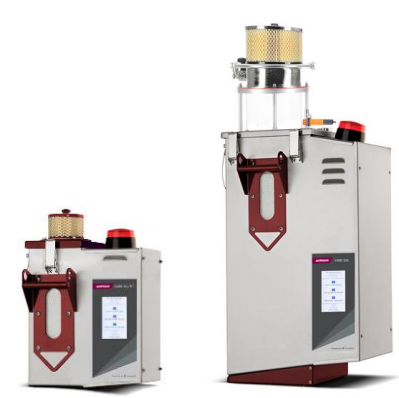
CARD G (left) and CARD S with FIT control system and optional OPC UA interface

With the integrated week timer, the use of the dryers can be ideally adapted to ongoing production planning, and they are ready to run immediately as soon as dried material is required. In the CARD S models, the compressed air consumption is very finely and precisely adjusted to the actual demand by an intelligent digital air volume control system.