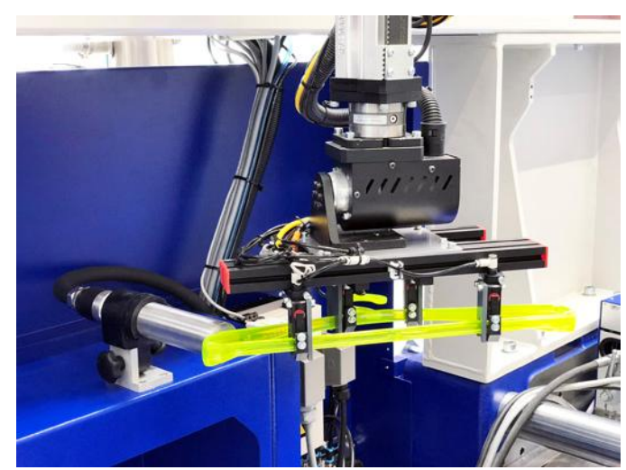
Printing on the part with an inkjet nozzle (shown on the left).