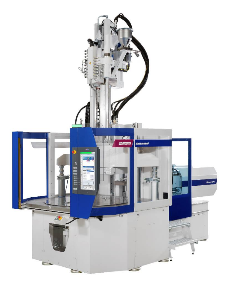
Fig. 1: VPower 120/130H/210V COMBIMOULD

At the K 2019, WITTMANN BATTENFELD will demonstrate the functionality of the VPower COMBIMOULD using a VPower 120/130H/210V. With this machine, a plug made of PA and TPE for the automotive industry will be manufactured with a 2+2-cavity mold. The complete automation system for the machine is designed by WITTMANN BATTENFELD Deutschland in Nuremberg. In this application, a Scara robot and a WX142 linear robot from WITTMANN are used, which insert the wrap pins, transfer the preforms, then remove and deposit the finished parts.