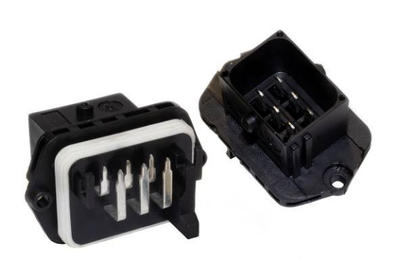
Fig. 4: Plug for the automotive industry