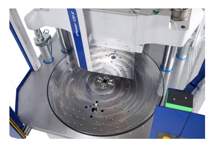
Fig. 2: Round table available in diameters of 1300, 1600 and 2000 mm