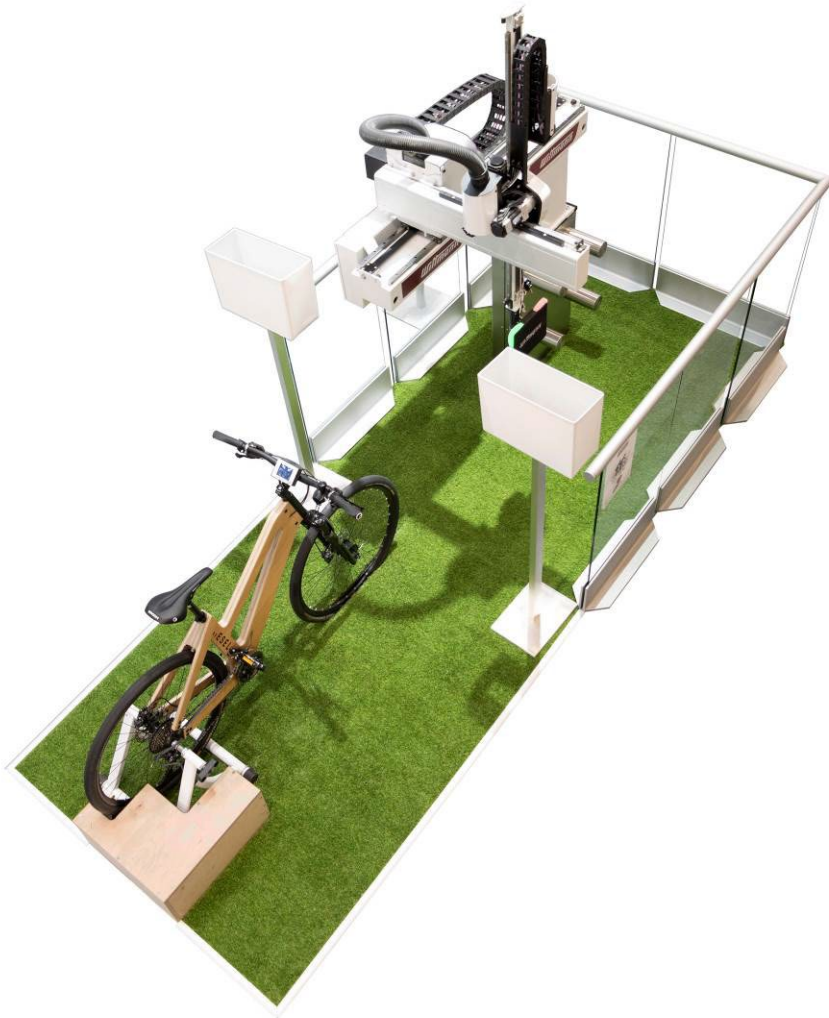
Fig. 4: ErgoRobot application using a Primus 14 robot from WITTMANN with an R8 control unit