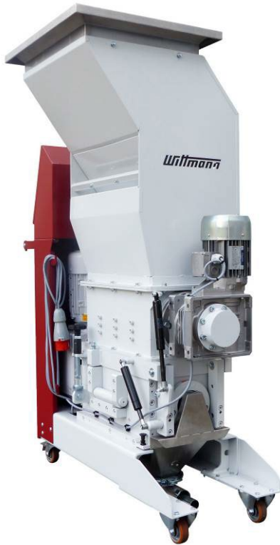
Fig. 7: Granulator S-Max 3