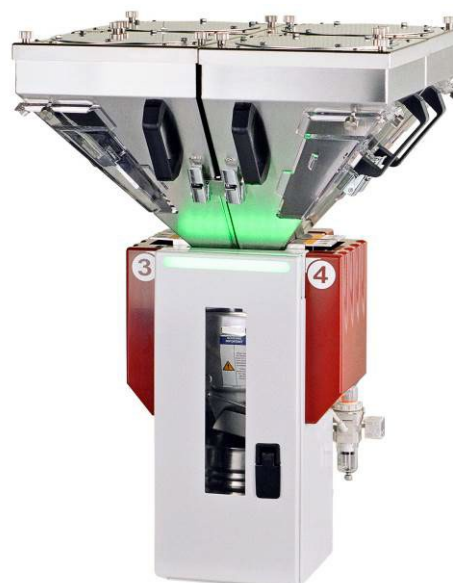
Fig. 6: Gravimax 14