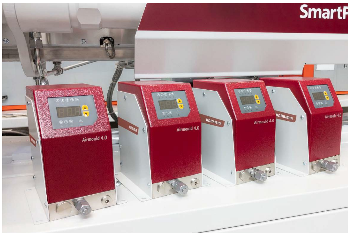
Fig. 2: Air mould 4.0