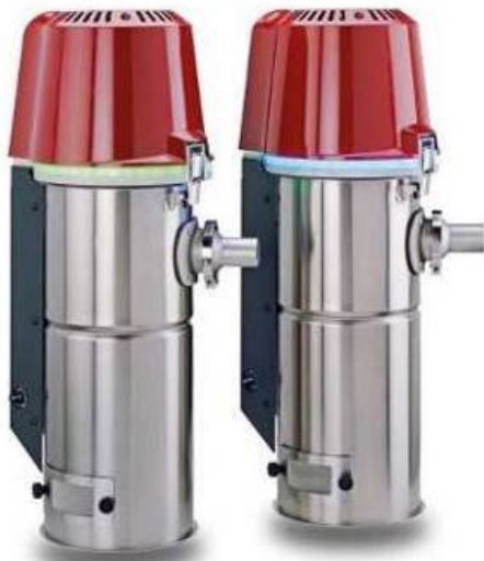
Fig. 5: Feedmax S3 net