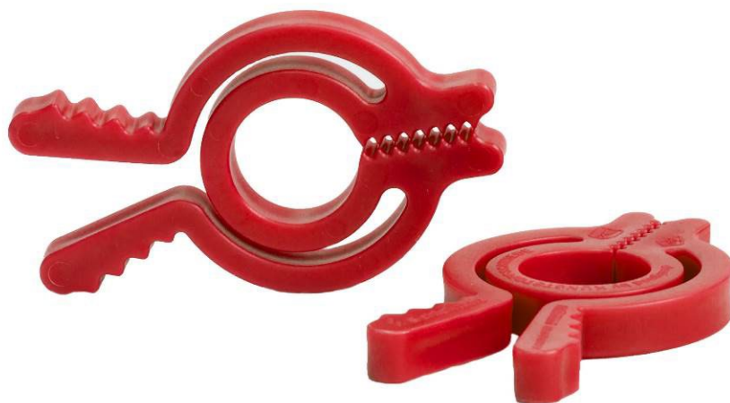
Fig. 3: Clothes peg, manufactured with Air mould 4.0 internal gas pressure technology