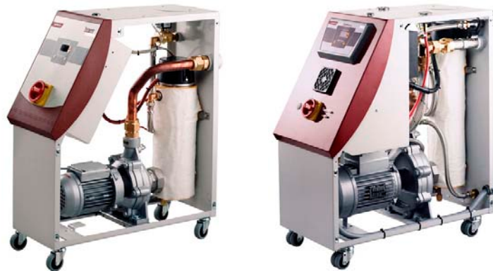
TEMPRO basic C120 directly cooled single-circuit temperature controller from WITTMANN, also available with an optional touch screen; large version of the appliance on the right.

The TEMPRO basic C120 temperature controller from WITTMANN scores with a special innovative feature: pressure-dependant temperature setpoint limiting.