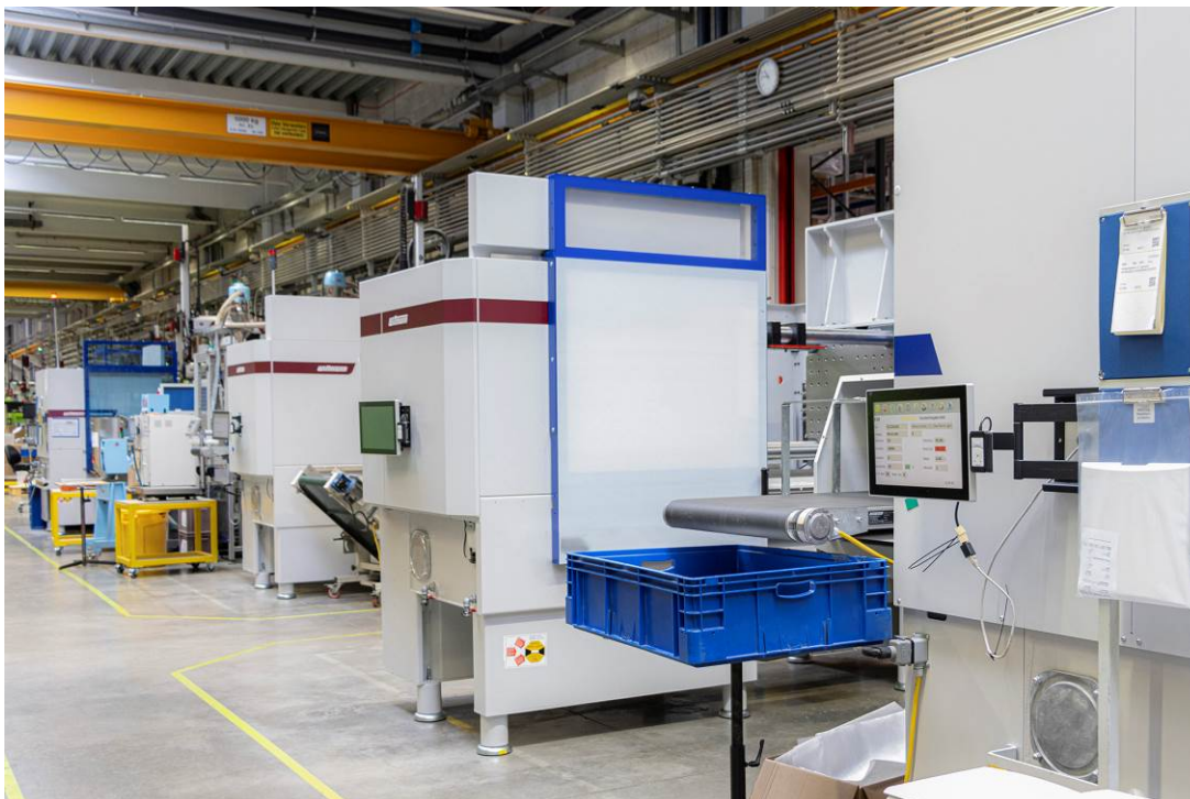
Fig. 2: SmartPower machines from WITTMANN BATTENFELD designed as Insider cells with WITTMANN linear robots (Photo: WITTMANN BATTENFELD)