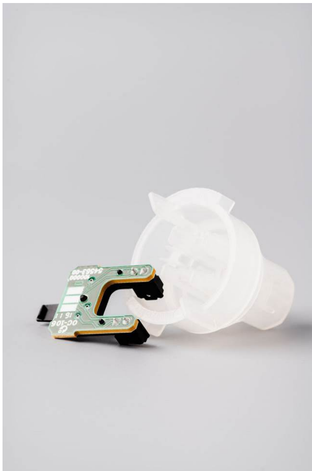
Fig. 4: Housing for aqua sensors to measure the water quality in BSH dishwashers