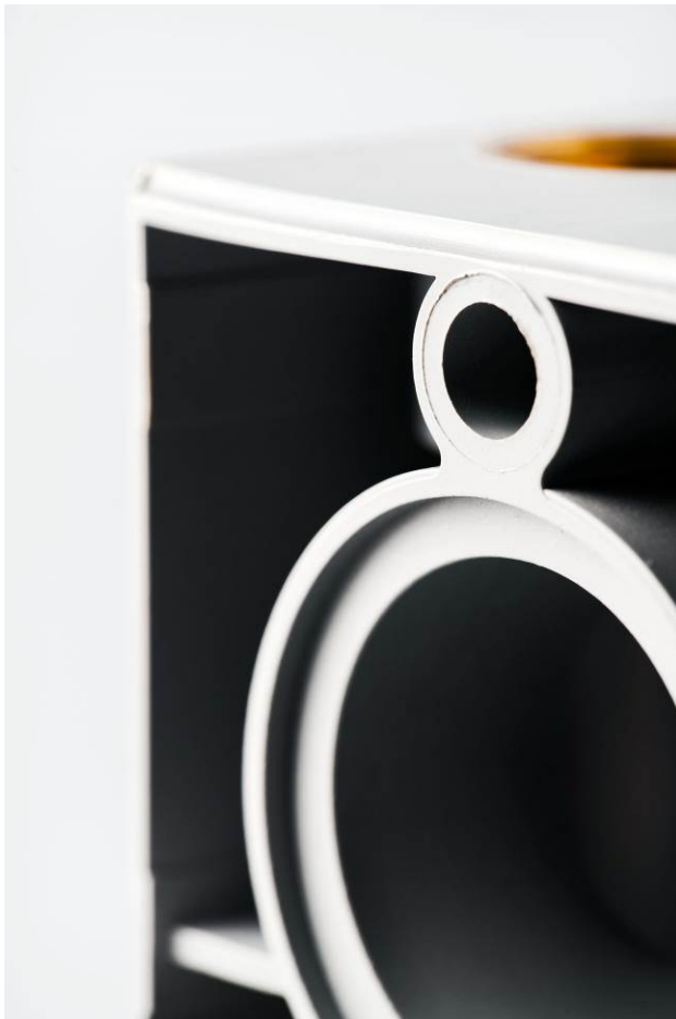
Fig. 5: Housing for WITTMANN flow controllers