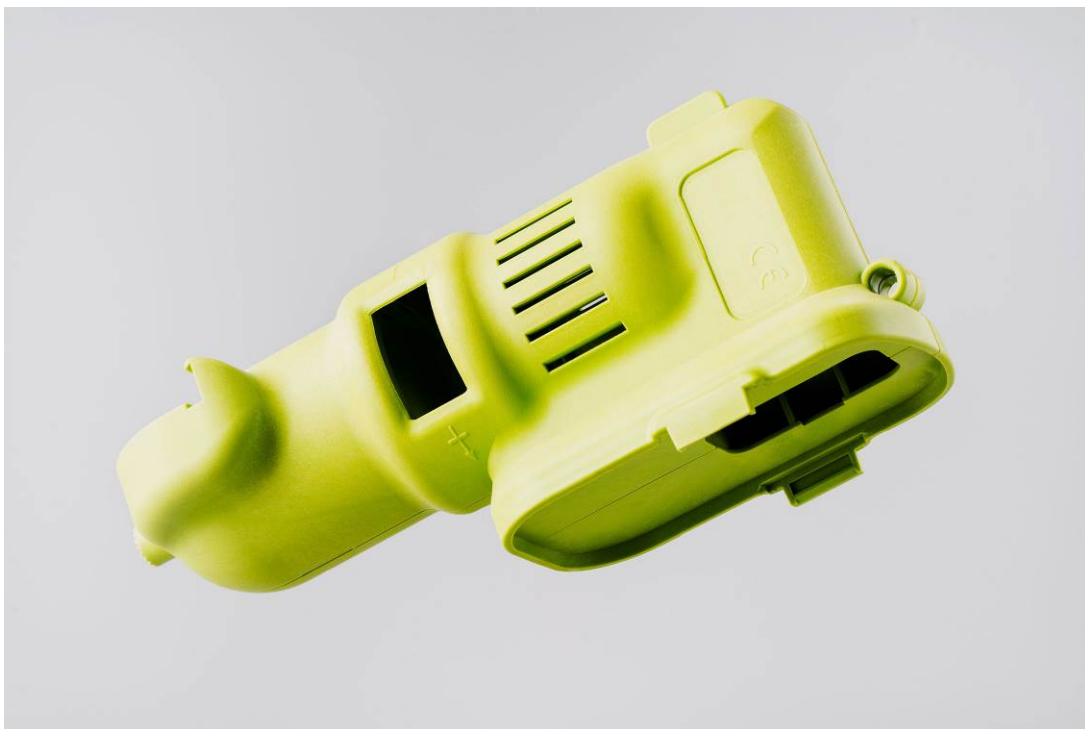
Fig. 6: Housing for an electrical tool