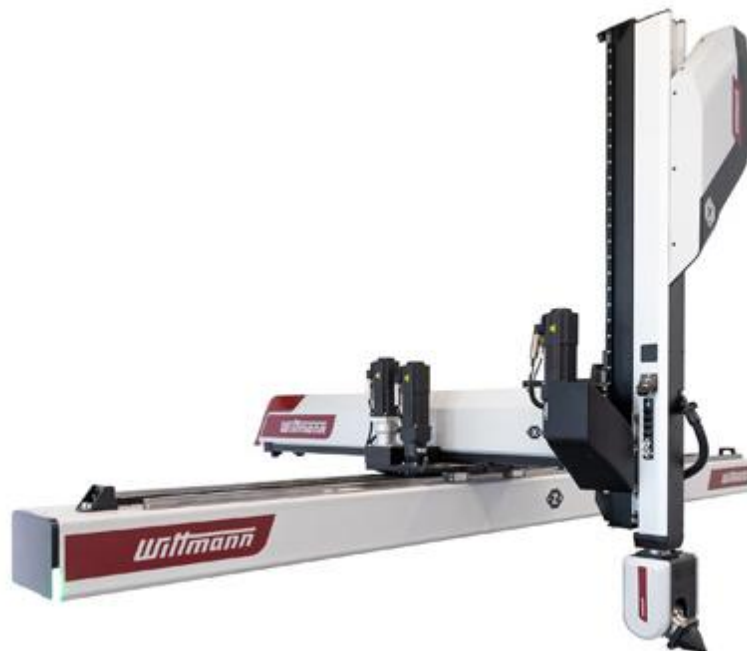
WX153 robot with servo rotation axis mounted on the vertical axis.

Available from June 2021: the upgraded WX153 robot from WITTMANN – the ideal automation solution for injection molding applications on machines with clamping forces from 500 to 1,300 tons.