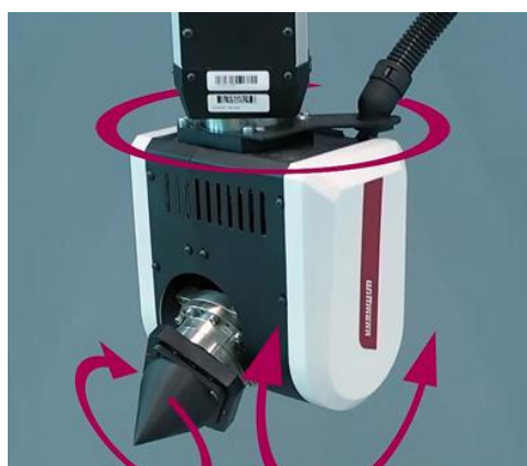
Schematic diagram of additional servo rotation axes.

The WX153 robot to be shown by WITTMANN in the first presentation by WITTMANN Interactive in Viennan on 19 May is equipped with three additional servo rotation axes ( A- , B- and C-Servo ). In this way, synchronized 6-axis movements or less axis movements can be programmed, with the R9 robot control system from WITTMANN coordinating automatically the speeds of the individual axes that have to be synchronized, so that all rotatory and translational motions are completed simultaneously.