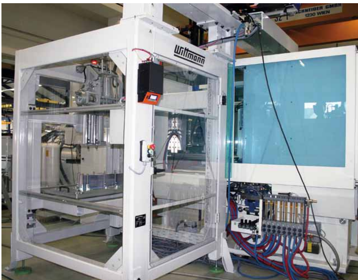
This view of one of the complete production cells at Tea Plast shows the TM injection molding machine from WITTMANN BATTENFELD and the WITTMANN W832 IML robot.