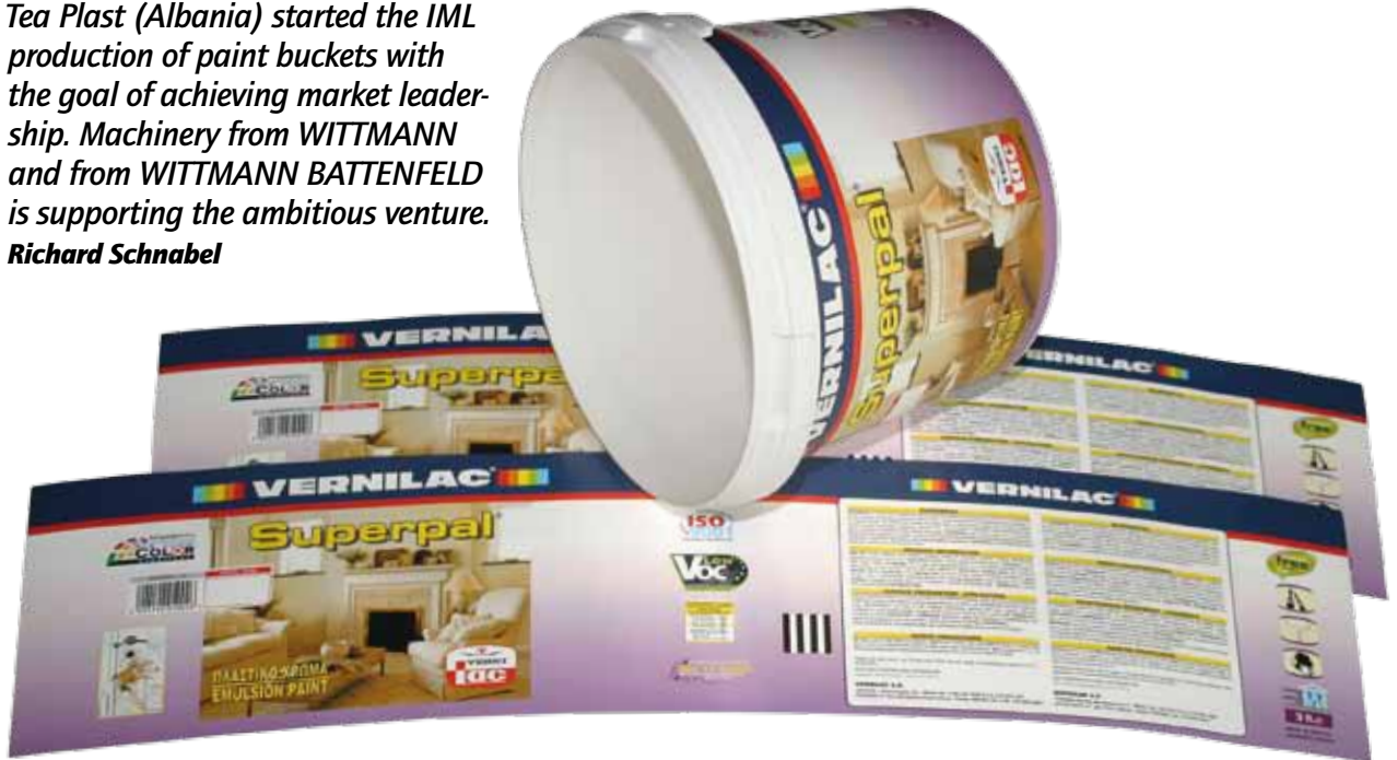
3.8 l IML paint bucket with two 360° banderol labels.

Tea Plast (Albania) started the IML production of paint buckets with the goal of achieving market leadership. Machinery from WITTMANN and from WITTMANN BATTENFELD is supporting the ambitious venture. Richard Schnabel