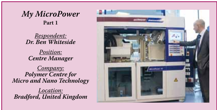
MicroPower injection molding machine at the Polymer Centre of the Bradford University, serial number 0001.

• Nickname yet? Not that I know of! • Customization? Plenty – and most of them have