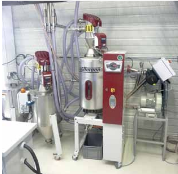
The NICOMATIC installations