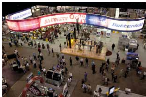
WITTMANN BATTENFELD booth at the NPE 2012 in Orlando.