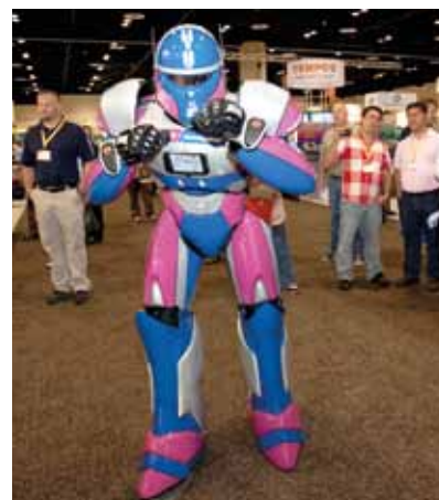
The WITTMANN BATTENFELD "Robot Man", supporting the NPE sales team.