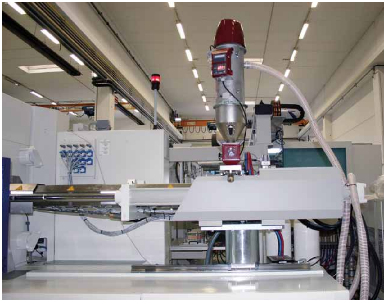
The material loading unit mounted on each injection molding machine, consisting of a FEEDMAX S3 and a DOSIMAX MC Basic from WITTMANN.