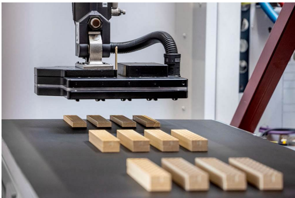
Fig. 3: Demonstration of the HiQ Melt Premium software by the production of bio building blocks from Fasal