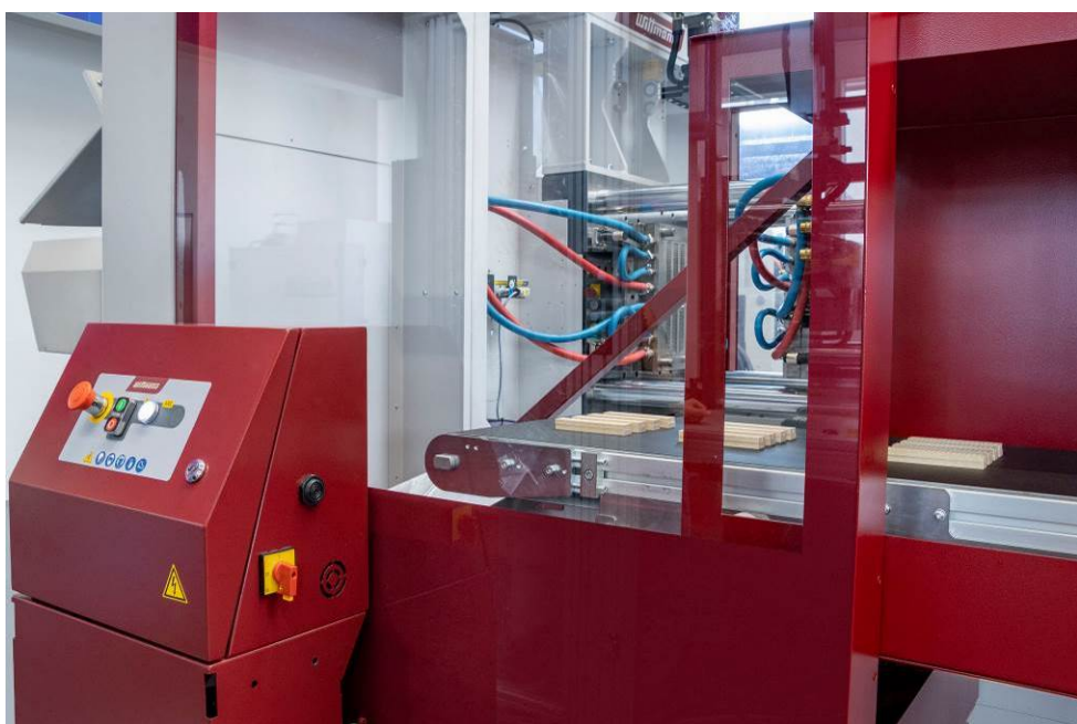
Fig. 4: WITTMANN S-Max granulator for spruce grinding