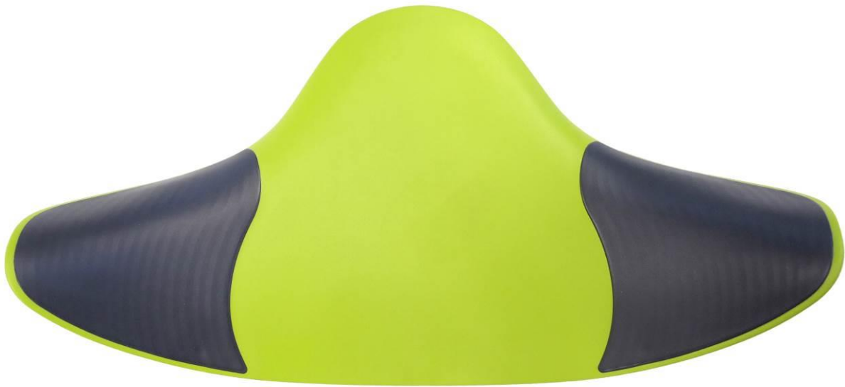
Fig. 6: Chair back in 2C technology