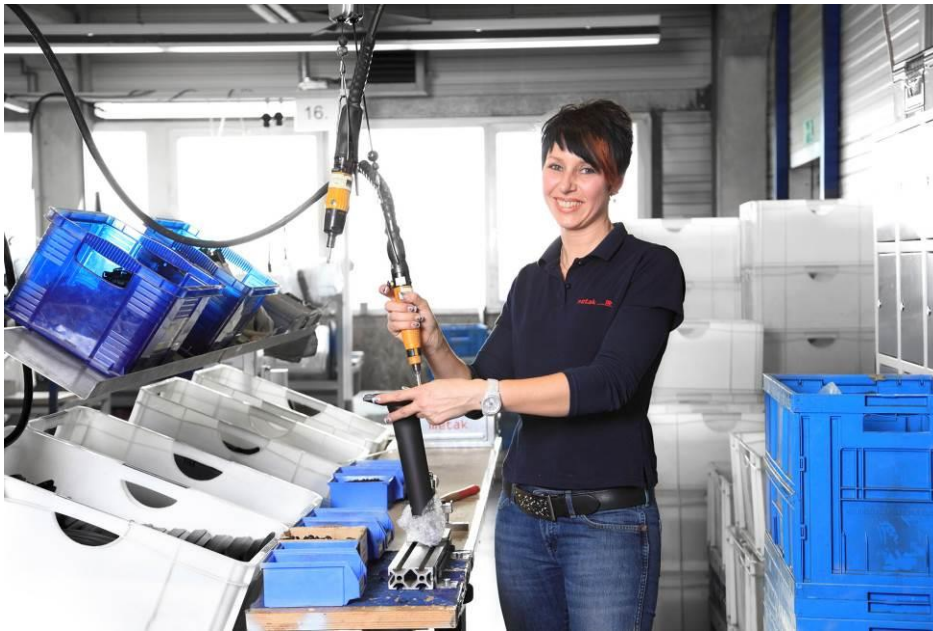
Abb. 2: Assembly of components at Metak