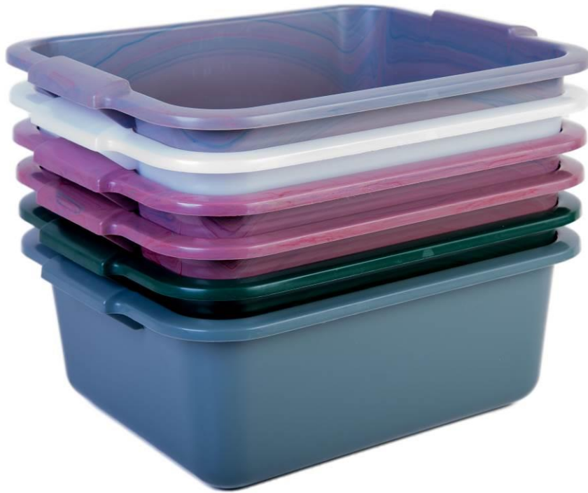
Fig. 4a, b, c: Metak also makes products for end consumers, such as plastic building blocks, mug holders or plastic containers