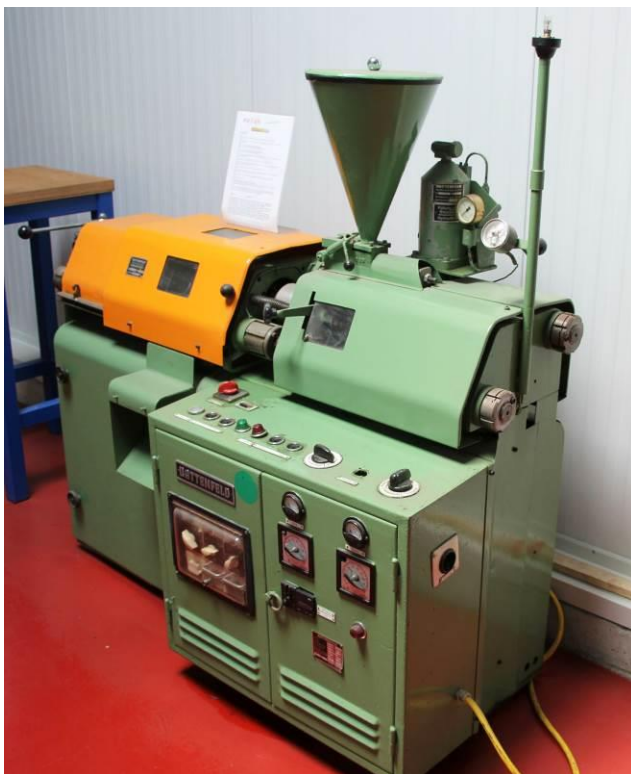
Fig. 3: BATTENFELD machine built in 1968 – today only of interest as a museum piece