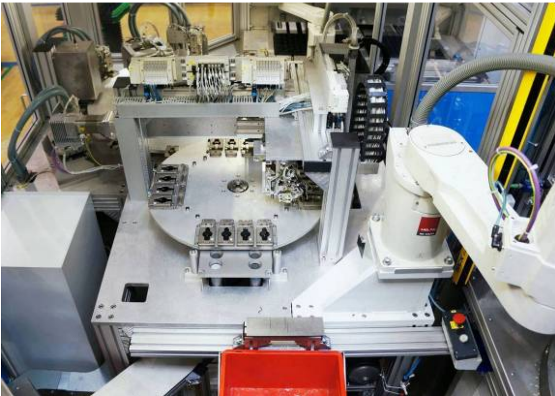
Fig.5a+b: A Scara robot connects the injection molding machine (Fig.5a) with the inspection station. Following inspection, the parts are deposited in transport trays by a transfer packaging station.