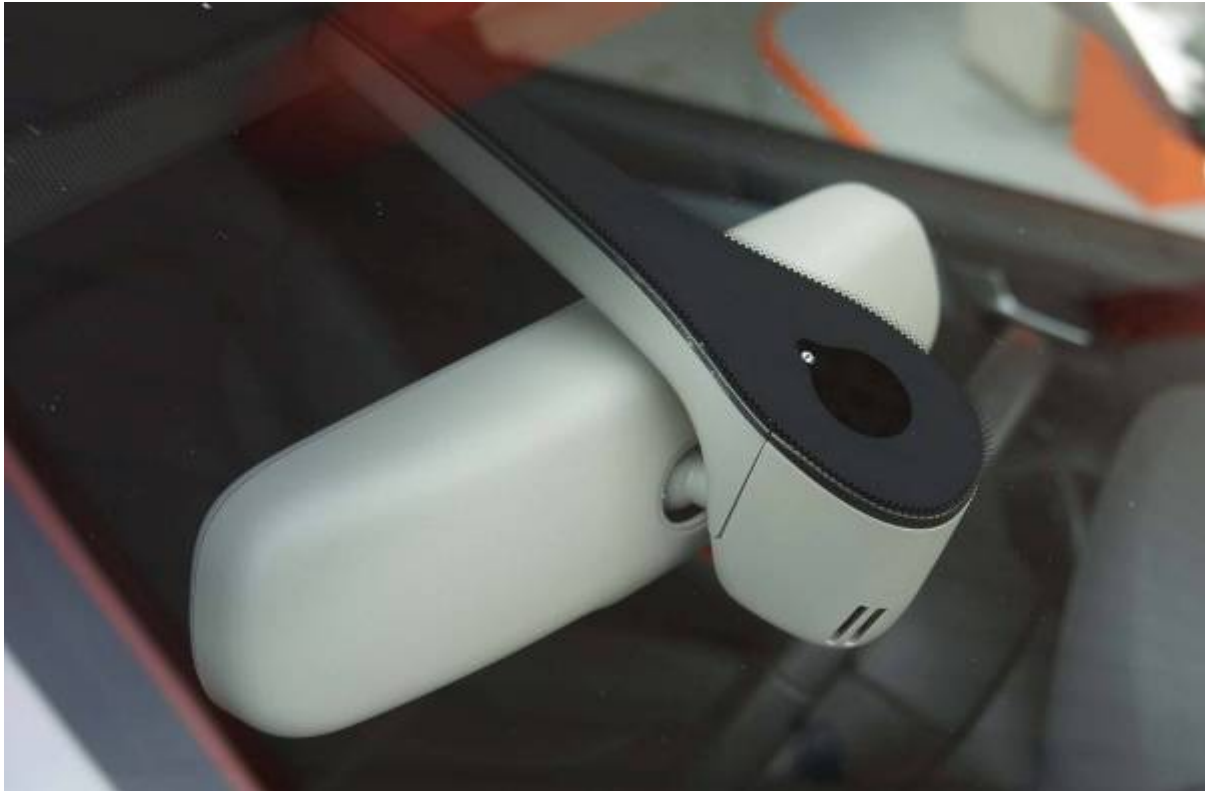
Fig.1: Installation example of a combination sensor for headlight and windshield wiper control integrated in the rear view mirror bracket on the windshield of a car.