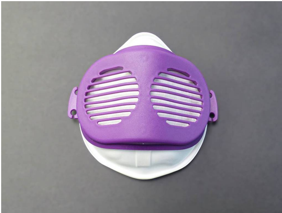
Fig. 3b: Community mask, M model, from FRÖBEL