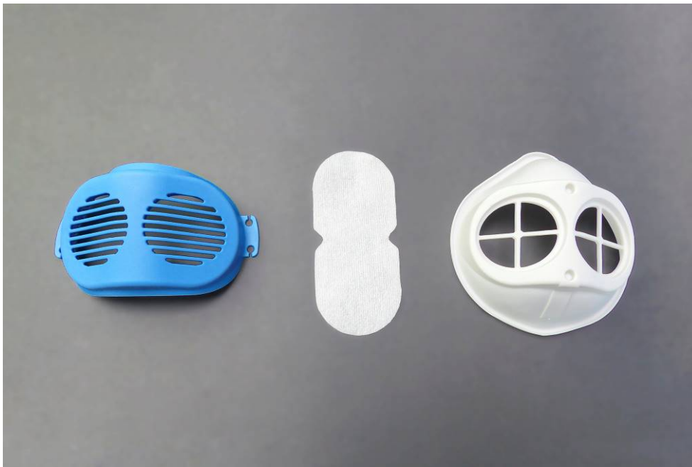
Fig. 3a: Community mask, M model – from the left: top piece of the mask, filter fleece and base made of TPE