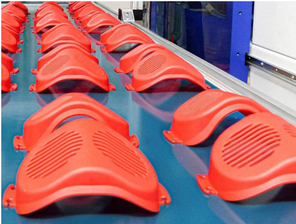
Fig. 2: Top pieces for the masks