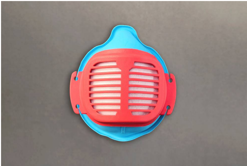
Fig. 4b: Community mask, S model from FRÖBEL