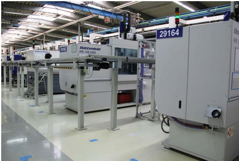
Fig. 1: All machines at Winkelmann have come from WITTMANN BATTENFELD