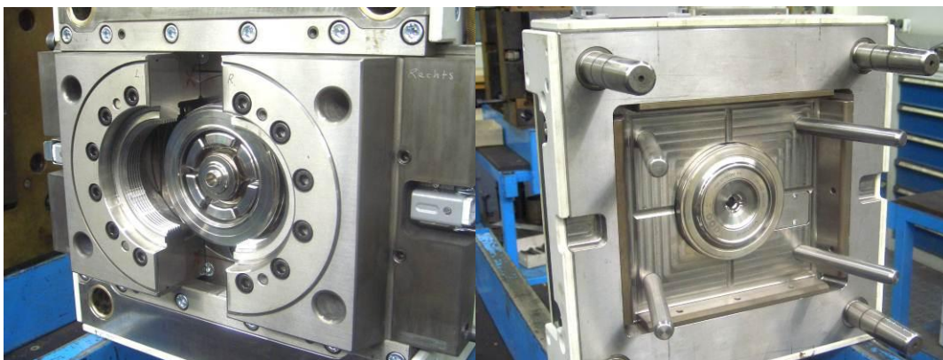
Fig. 3a + b: Injection stamping mold. On the left: mobile mold half with compression core. On the right: fixed mold half with sprue bushing and base plate