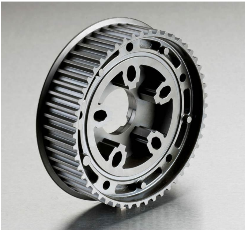
Fig. 5: Thermoset toothed belt wheel for a camshaft drive with integrated setting device for adjustment of the camshaft