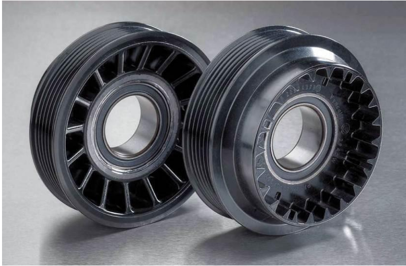
Fig. 4: Belt pulley with ball bearings to drive an air-conditioning compressor