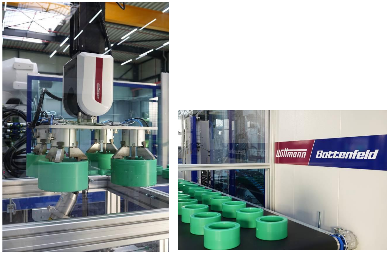
Fig. 5a+5b: Parts removal and depositing with WITTMANN W843 pro robot