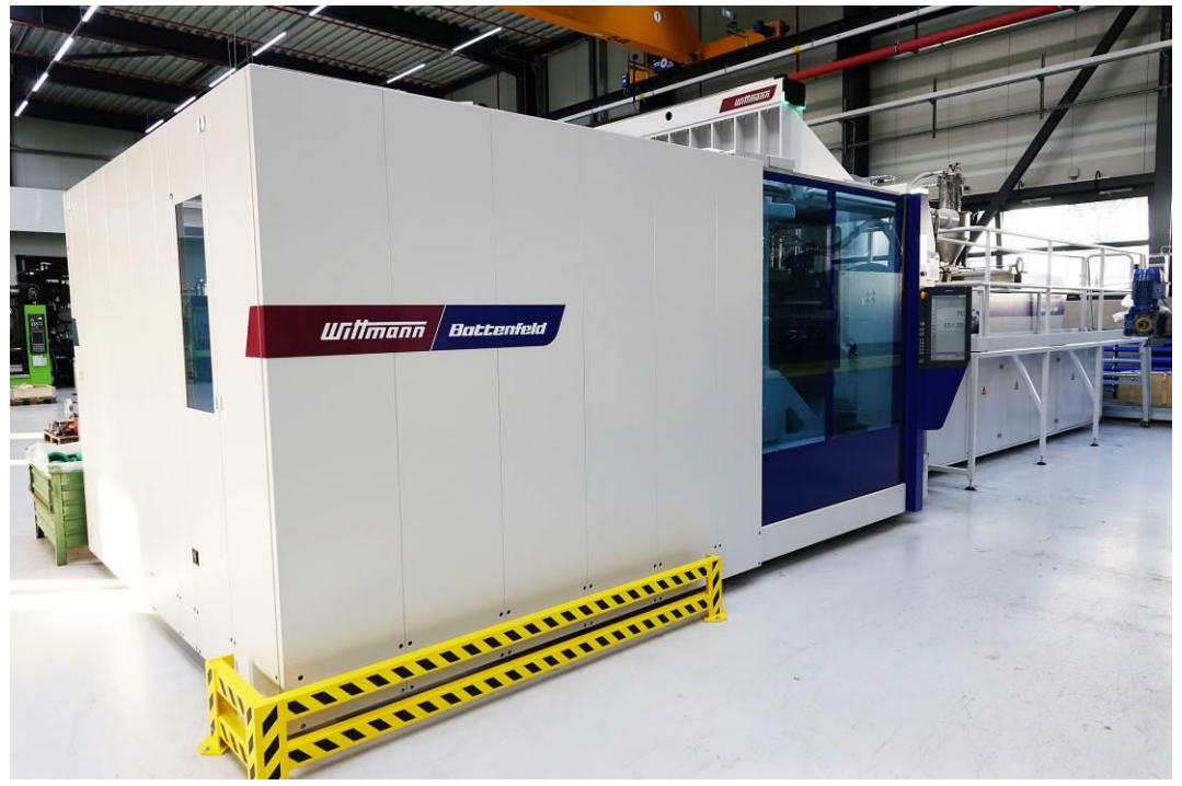
Fig. 3: MacroPower 1000/16800 at aquatherm