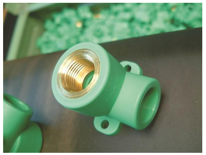
Fig. 6: Fitting with brass threading