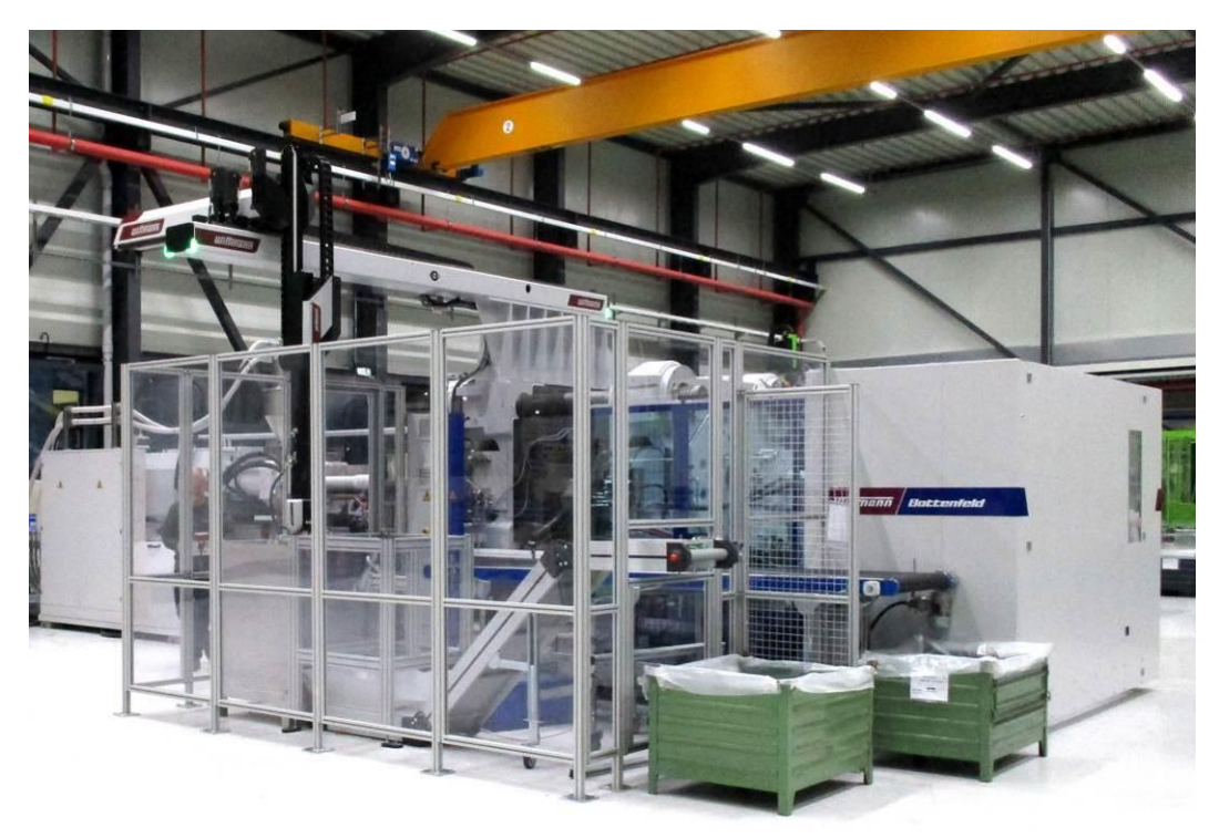
Fig. 4: MacroPower 1000/16800 with customized automation