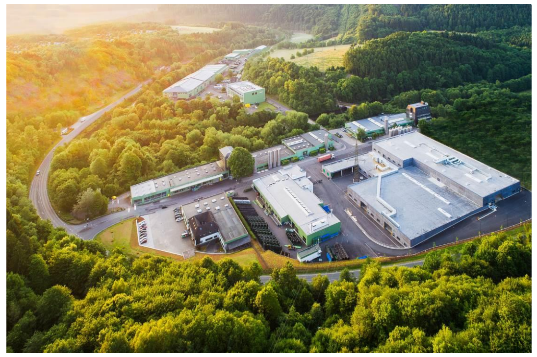
Fig. 1: The aquatherm plant located in Attendorn

Both the management team and the machine operators are fully satisfied with the new MacroPower after it has now been used in production for three months. Maik Rosenberg, one of aquatherm's three Managing Directors, comments: "In addition to its modest energy consumption and low noise level, the machine recommends itself by its high operating comfort. Its compact design and consequently small footprint is another great benefit of the MacroPower ".