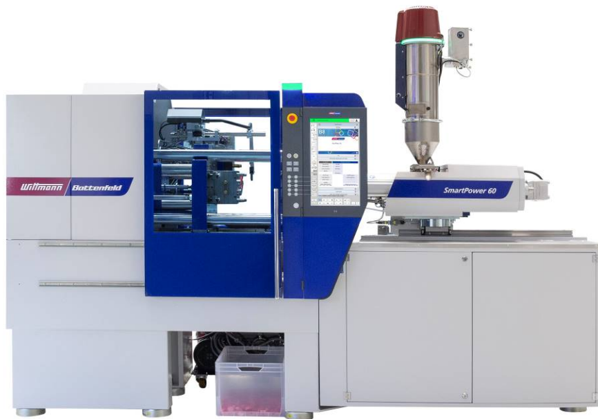
Fig. 4: SmartPower 60 as a compact insider cell