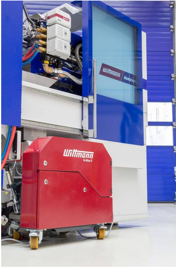
Fig. 3: Ingrinder – closeup view of integrated granulator