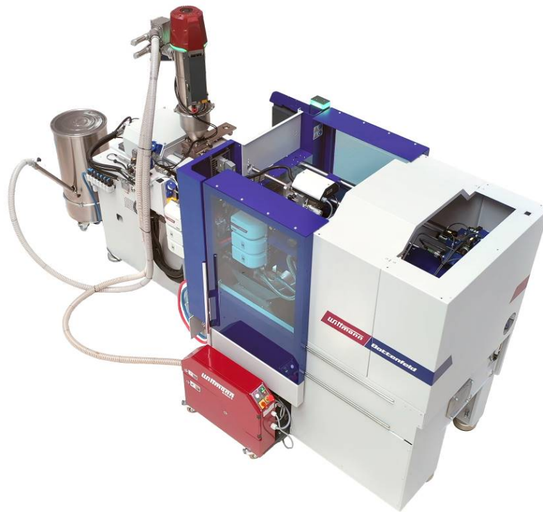
Fig.1: Ingrinder – SmartPower 60 with sprue picker, granulator and vacuum conveyor