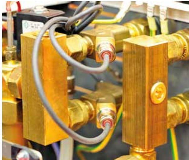
Picture on the left: A plastic cover protects the 5.7" touchscreen of the temperature controller. Picture on the right: Inside view of the TEMPRO plus D: the new dual ultrasound flowmeter from WITTMANN.

MANN and its pump supplier, a special pump was developed for this purpose, with higher pressure and lower displacement rates in liters. In this way, the pump's coefficient of performance has improved substantially, and cavitation inside the pump body has been largely eliminated. Distribution of the displacement volume among two or more circuits has also had a positive effect in terms of constant heat distribution and better perfusion in the mold. All of these steps taken together have led to significant improvements in the surface of molded parts, and shorter cycle times have been achieved as well.