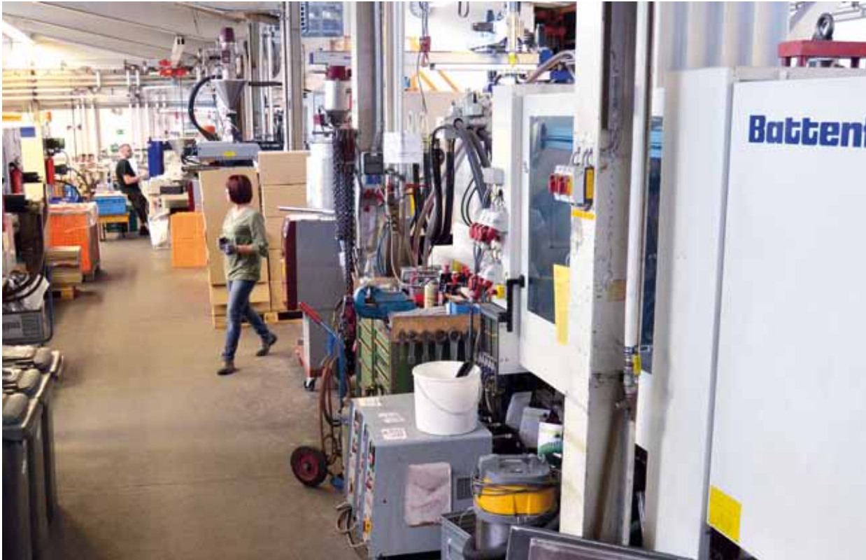
15 of the 18 injection molding machines at Heibel Formplast have come from WITTMANN BATTENFELD.

The ServoPower design principle further increases the machine's efficiency, because the lower energy input also leads to less heating up of the hydraulic oil, which, in turn, reduces the consumption of cooling water. Simultaneously, the load on the hydraulic oil is lessened, which increases its service life. There is also a significant reduction in noise emission. Finally, the lower idle power rate (due to the servo motor's higher degree of efficiency) leads to additional sav-