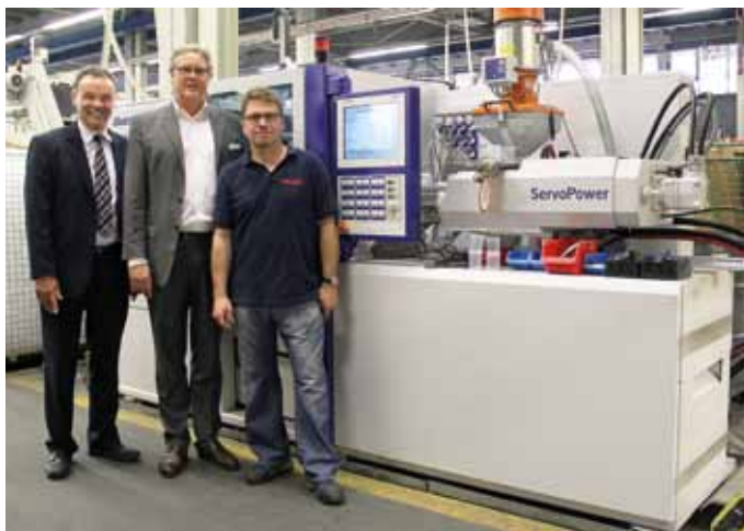
For injection molding, exclusively WITTMANN BATTENFELD machinery is used.