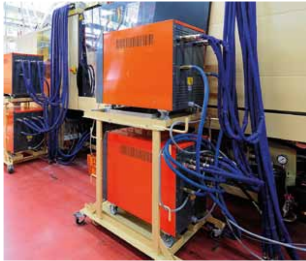
WITTMANN TEMPRO plus D temperature controllers installed at Julius Blum GmbH in Höchst, Vorarlberg. Transport carts with two levels serve to minimize space requirements. Besides ultrasound flowmeters, the dual-circuit appliances come with several other special features.